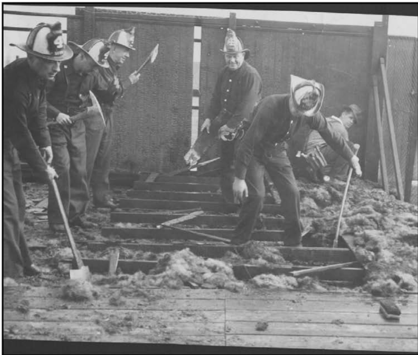
2ND ALARM - JUNE 25, 1938 STANFORD HOSPITAL

This section is dedicated to all the retired members of Local 798, who worked many long hours to maintain and improve the working conditions and benefits enjoyed by all San Francisco Fire Fighters. Retirees' efforts established a solid framework of working conditions and benefits for active members to build upon.. Let us never forget . . .